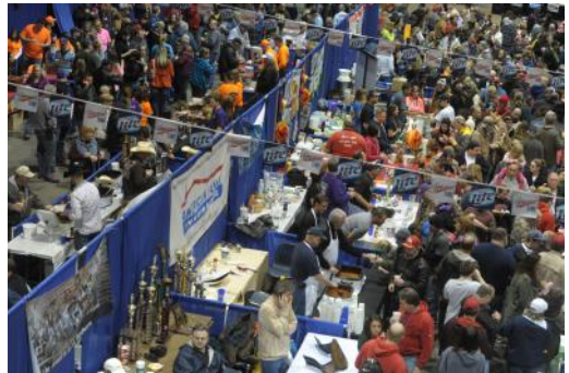
Our crowd will be virtual this year